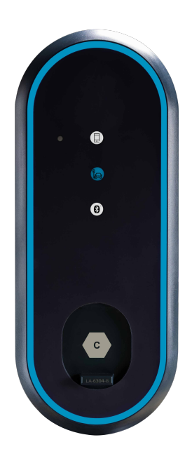
eBOX smart with Type 2 socket

eBOX smart is a future-proof charging solution for electric vehicles. It is particularly suitable for networked use in the private and commercial sector. It features fast charging with up to 22 kW and can be networked via WLAN. The backend connection is made via OCPP 1.6J. eBOX smart communicates with the user via a coloured LED ring, thus enabling intuitive user guidance. With the help of eCLICK, eBOX smart can be mounted on the wall or on a pillar and is available with both Type 2 socket and Type 2 charging cable.