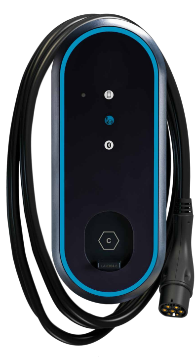
eBOX smart with Type 2 charging cable